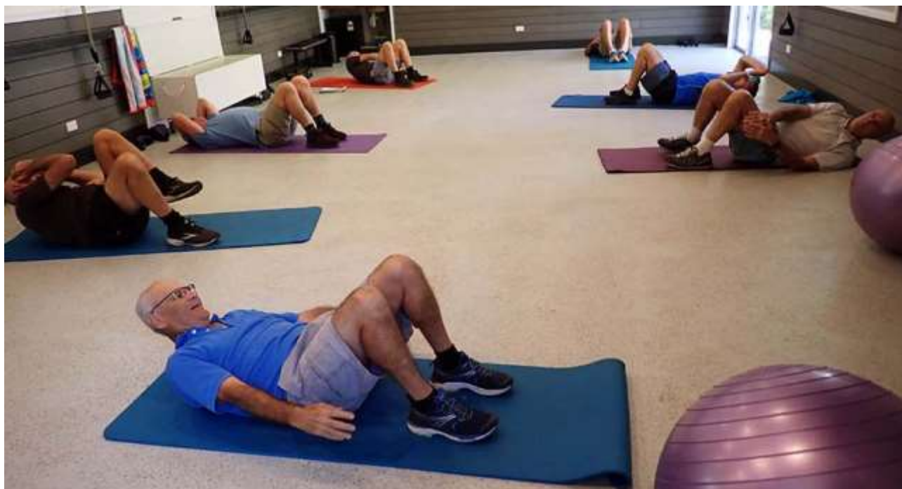
Laying around like lizards during the regular Exercise Class in the Health & Activity Shed.