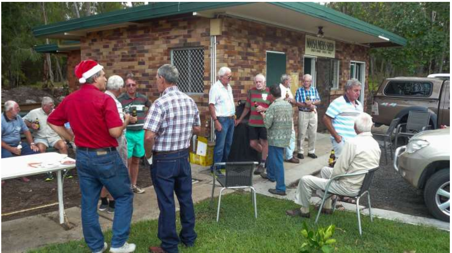
The first Christmas celebrated by Noosa Men's Shed outside the old Water Testing Laboratory being used as the Office and Training Room - 12 December 2014.