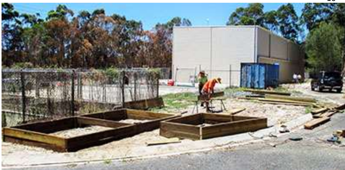
Looking toward the Office & Wood Shed sites nine years ago in November 2014.