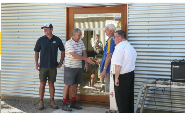
Photos from our opening

We now look forward to using this building for Painting and Drawing, Upholstery, Innovation and Inventors and lots of other "clean" crafts