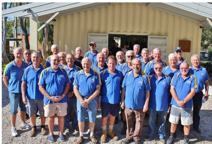
A very happy band of shed members at the opening