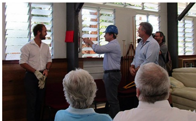
Cutting the chain (wire) to unveil the plaque