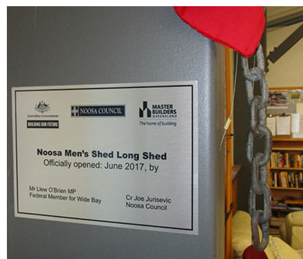
The Plaque unveiled