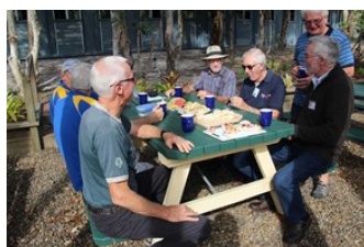
Connecting over a healthy morning tea