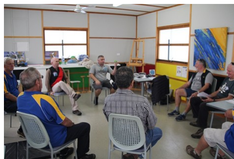
Discussion about Mental Health issues