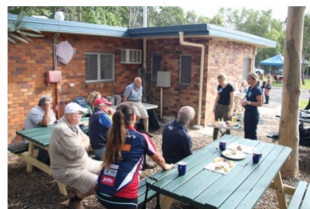
Dietetic Students and Staff from Sunshine Coast Uni. Giving us some tips on healthy eating